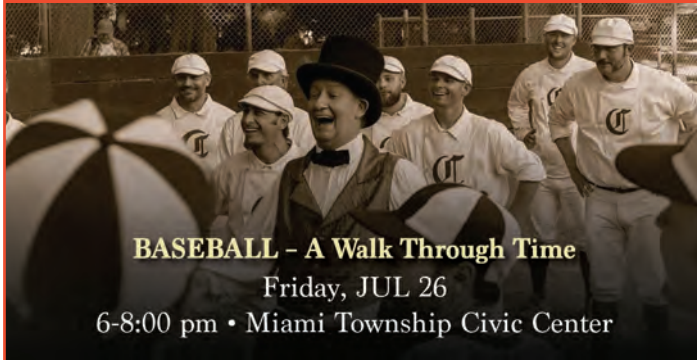
BASEBALL - A Walk Through Time Friday, JUL 26 6-8:00 pm • Miami Township Civic Center