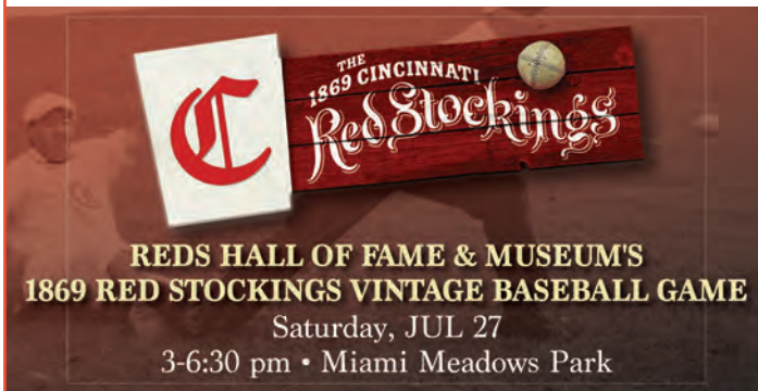
REDS HALL OF FAME & MUSEUM'S 1869 RED STOCKINGS VINTAGE BASEBALL GAME Saturday, JUL 27 3-6:30 pm • Miami Meadows Park