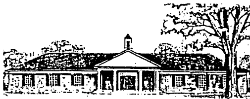
MIAMI TOWNSHIP CIVIC BUILDING