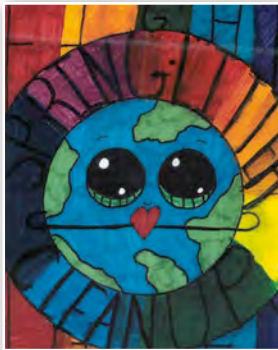
2019 T-Shirt Contest Winner

WE NEED YOU! Register individually or as a group and participate in this fun, worthwhile event to clean up our community. All volunteers will receive a t-shirt and a free lunch for helping out.